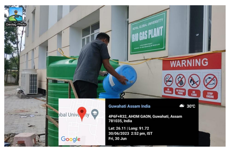
Biogas plant is installed behind D-Block of the University

The University features a biogas plant as a vital alternative energy source, demonstrating its commitment to sustainability and reducing reliance on traditional fuels, thus fostering a greener campus environment.