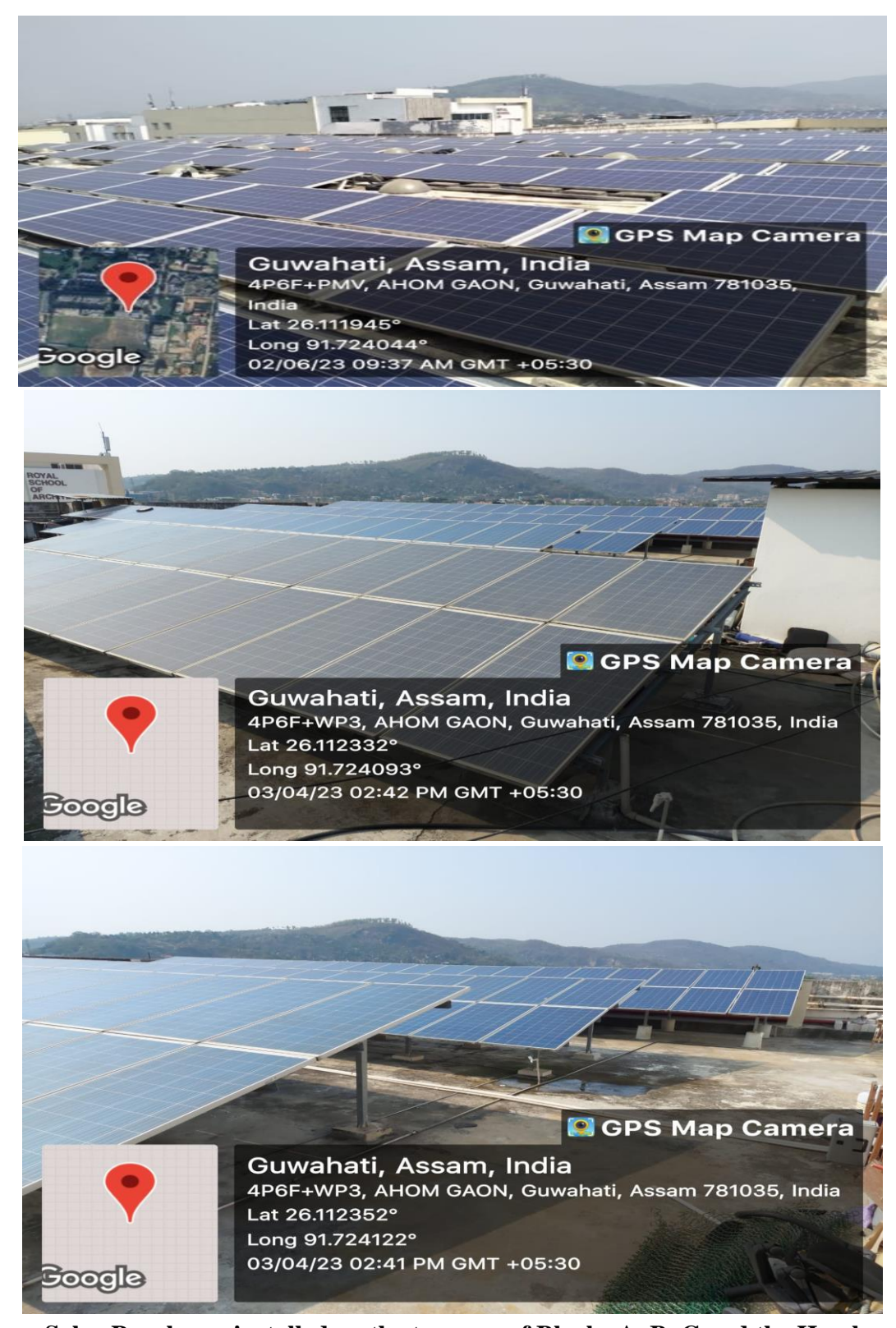
Solar Panels are installed on the terraces of Blocks A, B, C and the Harsha Hostel of the university.

The Assam Royal Global University has set up a 165 kbh Roof Top Solar Plant on the campus to reduce dependence on non-renewable forms of energy.