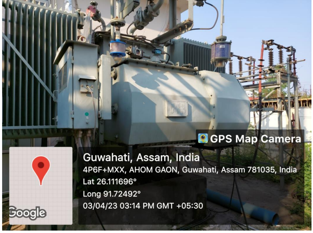
Wheeling to the Grid

The University's solar plant contributes power to the grid, serving as an innovative alternative energy source that enhances sustainability efforts and reduces environmental impact on campus and beyond.